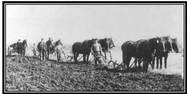
Plowing - Courtesy of the S.D. State Historical Society

(Research project - possible group assignment)